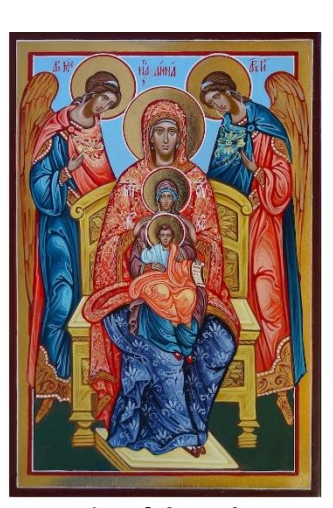
Maternity of the Holy Anna Feast day December 8<sup>th</sup>