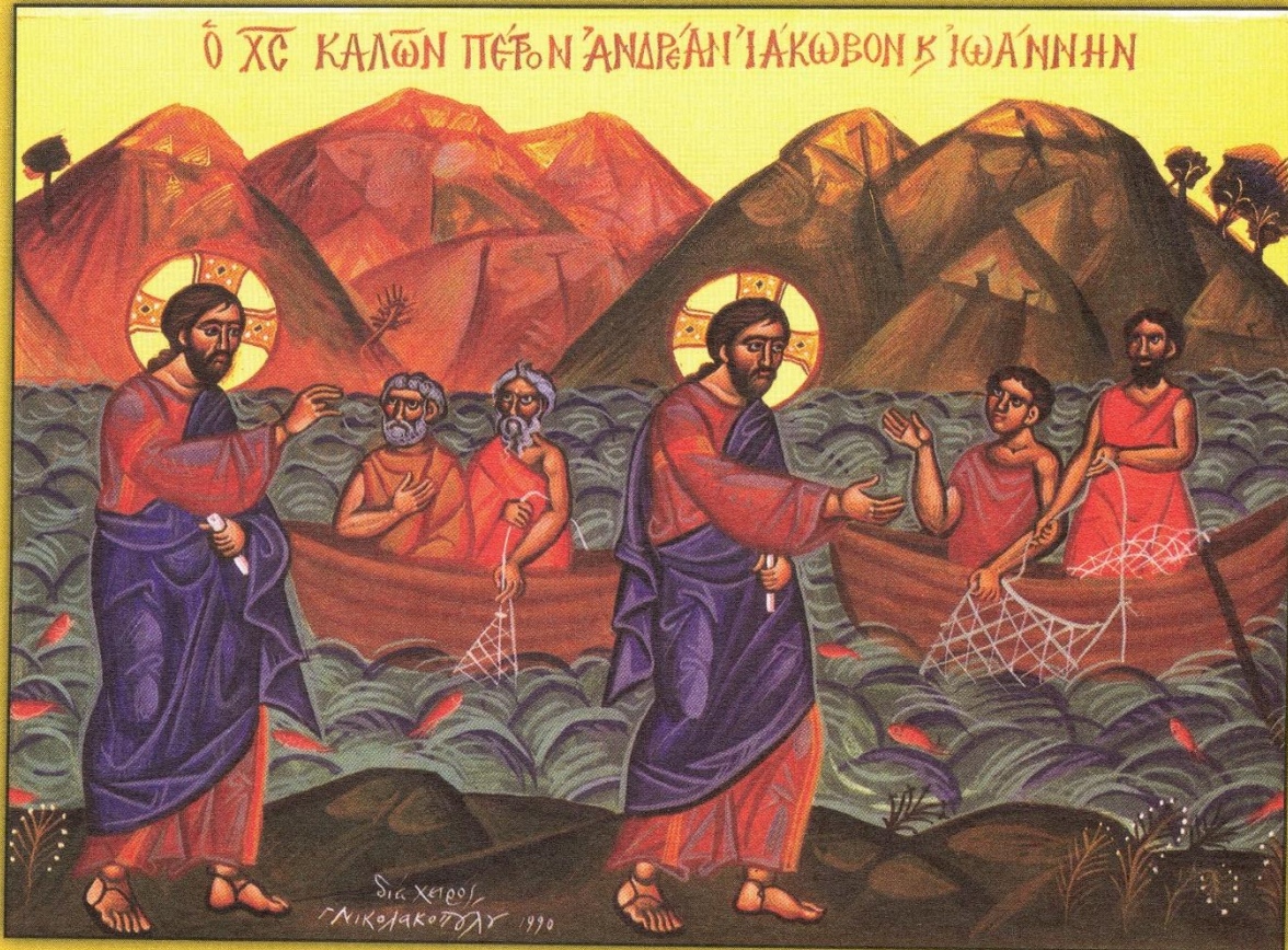
Icon of the Call of the First Apostles