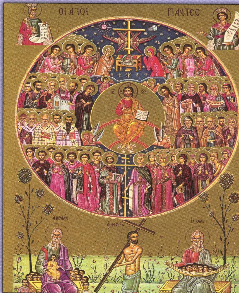
Icon of All Saints