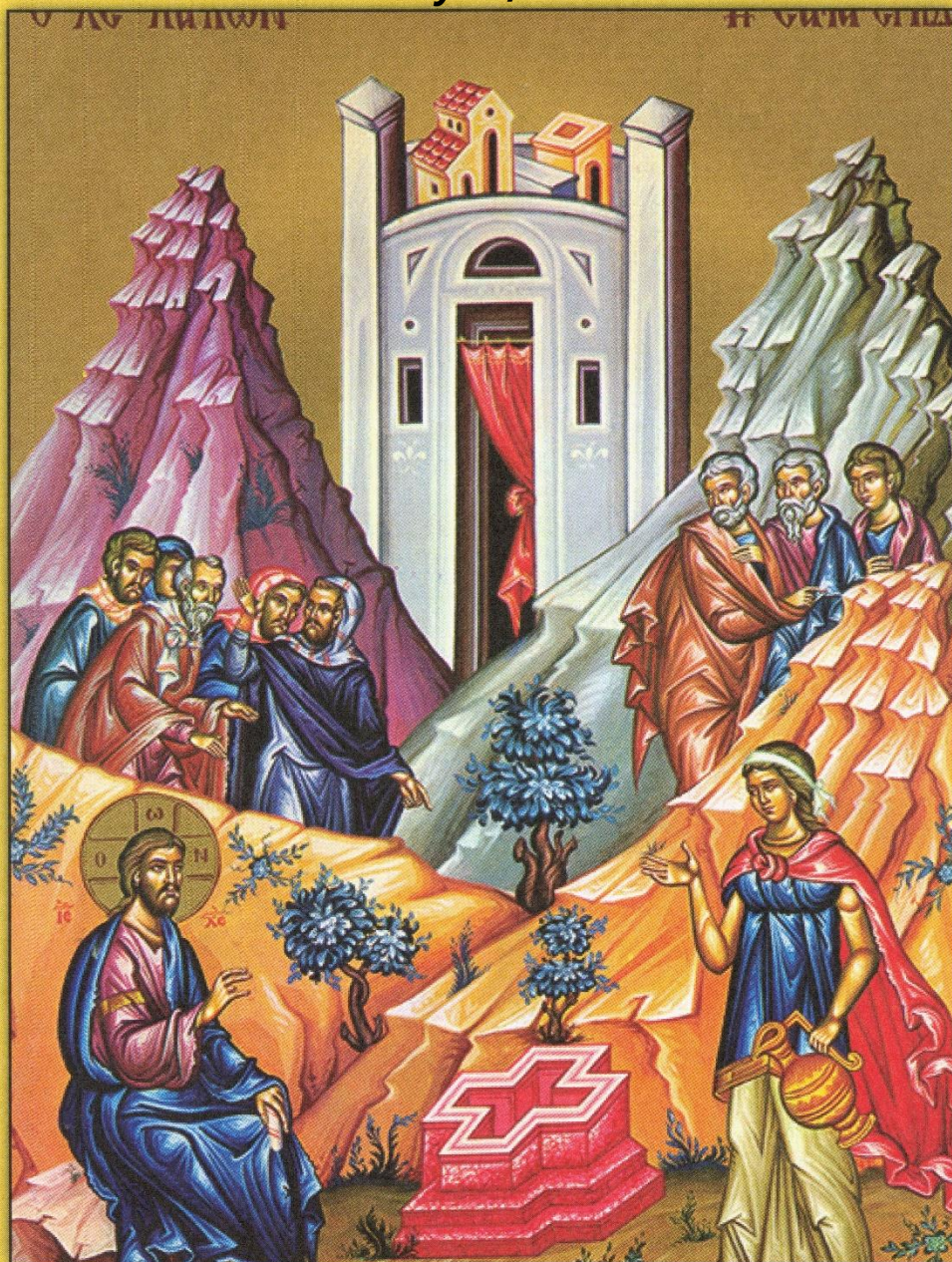
Icon of Christ and the Samaritan Woman