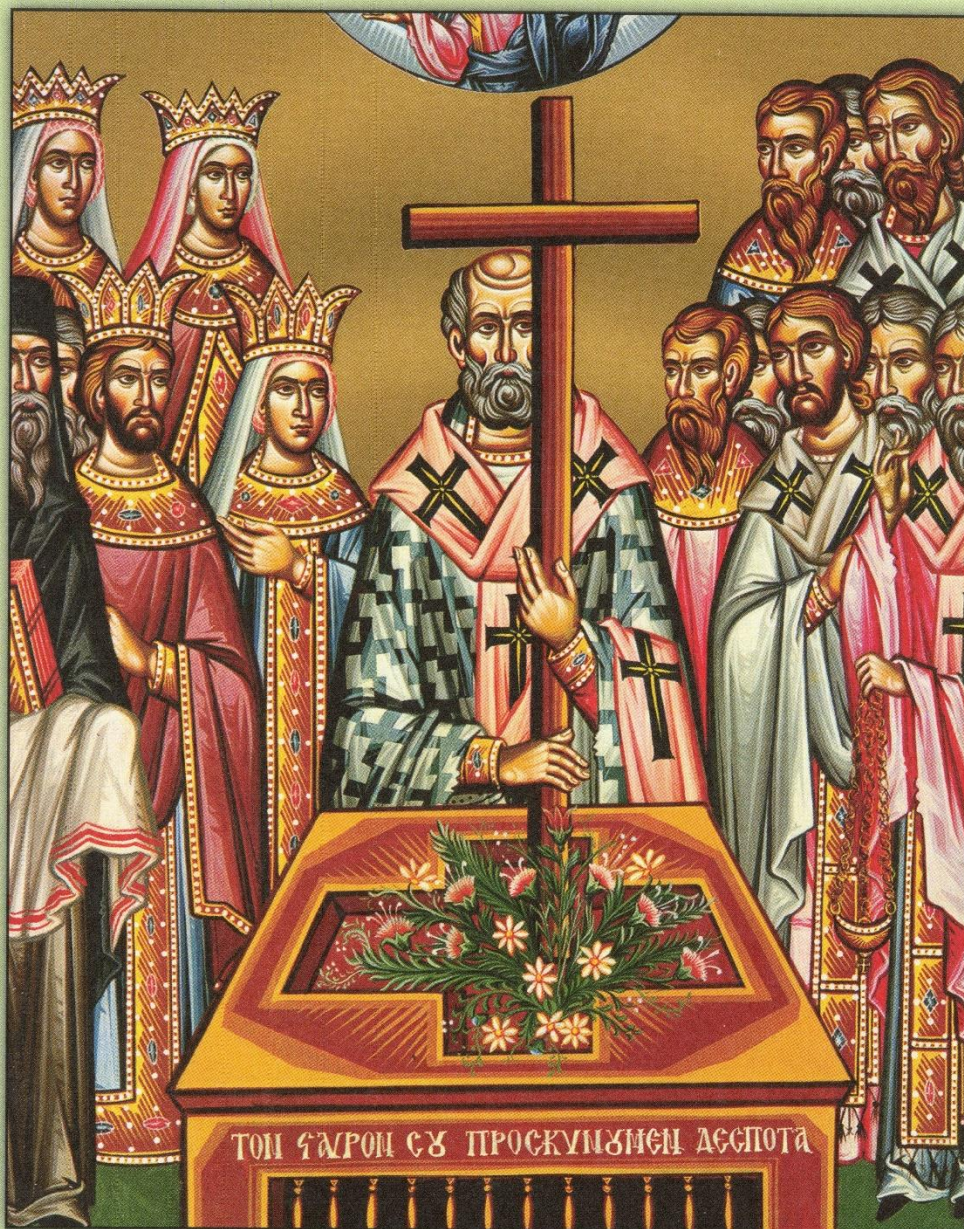
Icon of the Exaltation of the Holy Cross