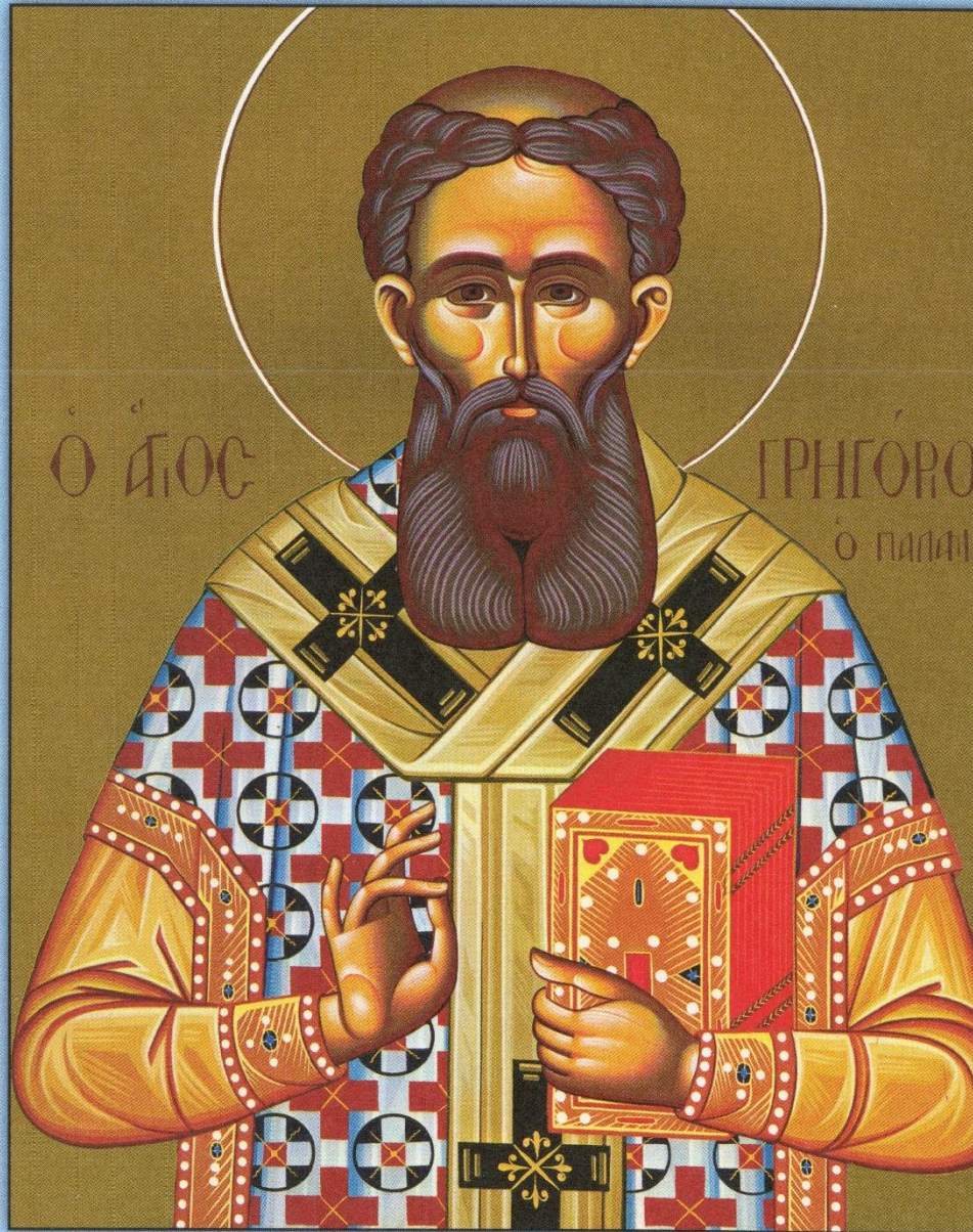
Icon of Saint Gregory Palamas