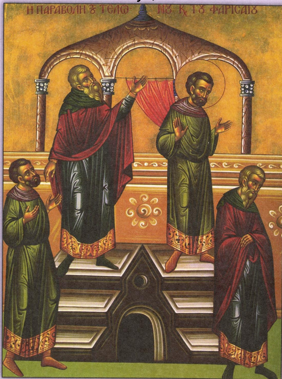
Icon of the Publican and Pharisee