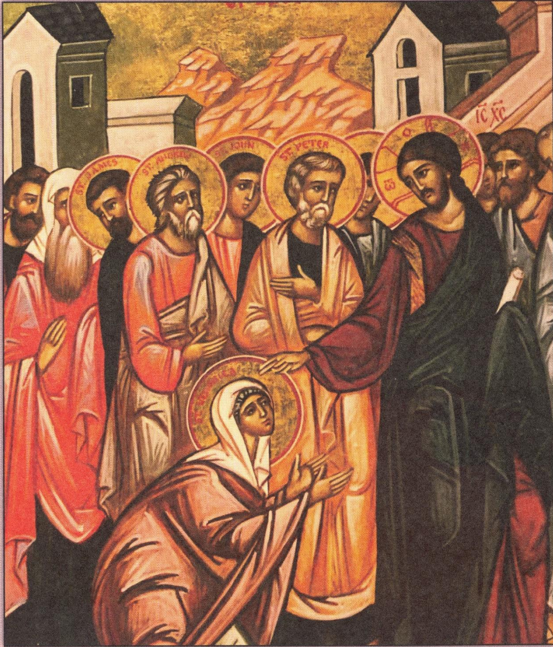
Icon of the Canaanite Woman (Matthew 15:21-29)