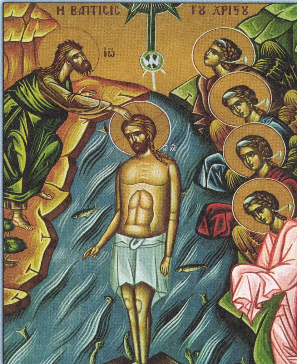
Icon of Theophany -- January 6th