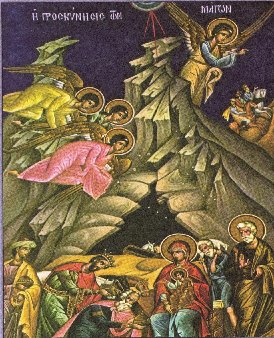
Icon of the Visit of the Magi