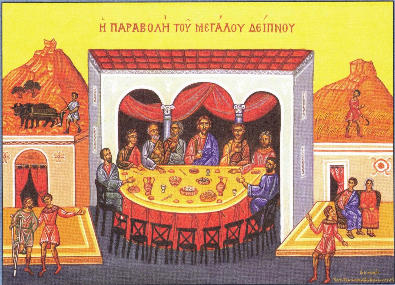
Icon of the Parable of the Great Feast