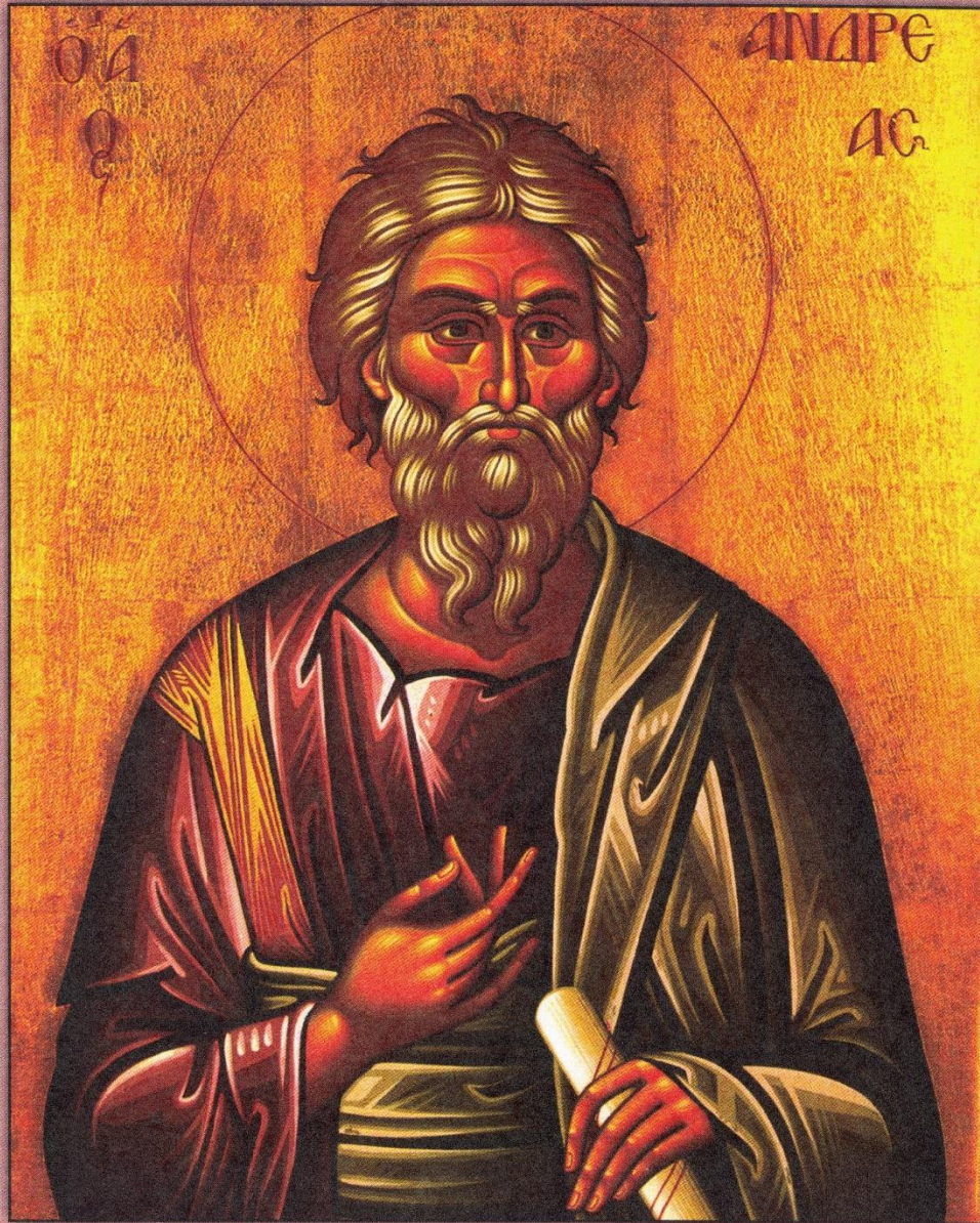
Icon of Saint Andrew -- November 30th