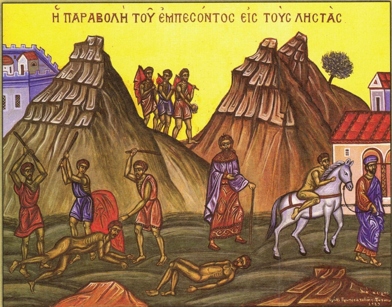
Icon of the Parable of the Good Samaritan (Luke 10:25-37)