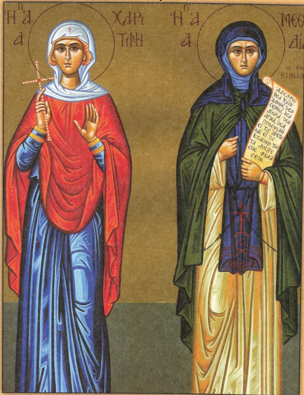
Icon of Saints Charitina and Methodia -- October 5th