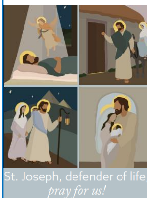
St. Joseph, defender of life, pray for us!

We live in a violent society that sees violence and death by abortion, euthanasia, suicide and capital punishment as a solution to many of our personal and societal "problems". And many of these attitudes are enshrined in our law and culture, leading to more