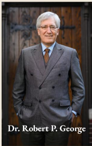
Dr. Robert P. George